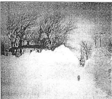
The blizzard of 1899 created 8 ft. drifts on Washington St. near The Winsor House.

Bad winter storms were recorded with regularity in 1947-48, 1955, 1958, 1962, 1969 and 1970-71, culminating of course in the storm of the century: The Blizzard of '78. Today we may be inconvenienced for a day or two, but the milk famines, no mail for a week, and stranded trains on bridges are reminders of the long-lasting effects of blizzards of years past. If anything, the remembered blizzards of the 20th century put the Blizzard of '05 in perspective: it is just usual winter weather for New England.